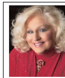
Beverly Masseur Inspirational Music